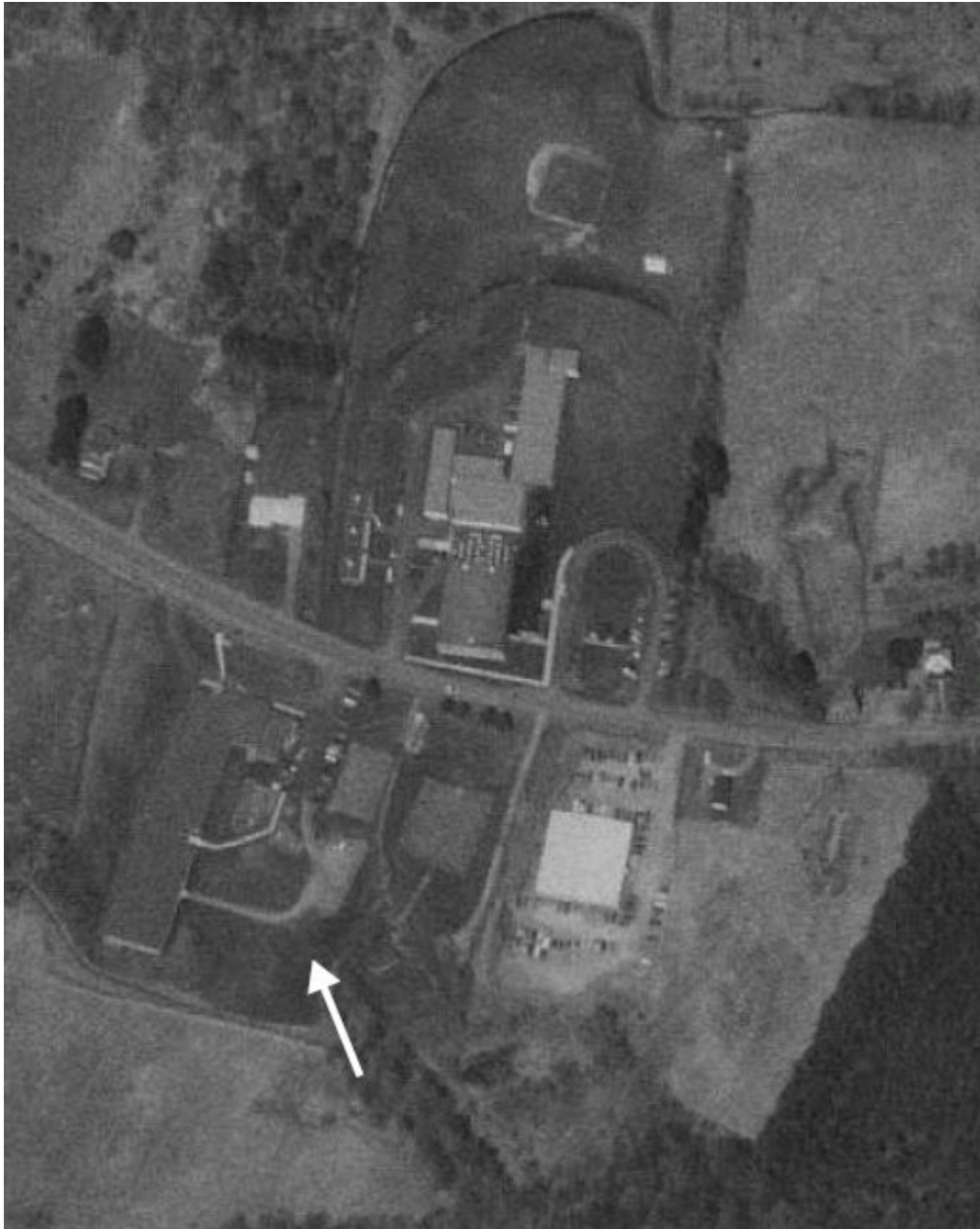
Aerial View of Liberty Elementary School

1994 Liberty SW, PA Aerial Photograph . USGS Reference Number 41077-E1-04-PHT. Created on April 18, 1994.